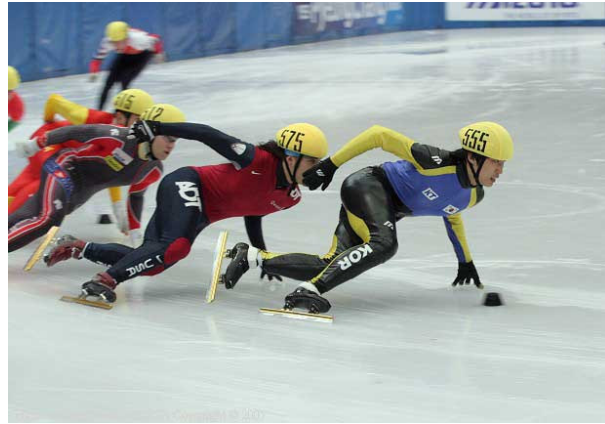
going wider and deeper