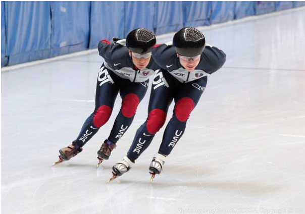
Following on outside shoulder